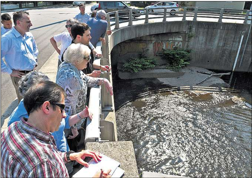
Members of the Army Corps of Engineers and local officials inspecting the Peckman River in Little Falls in May.